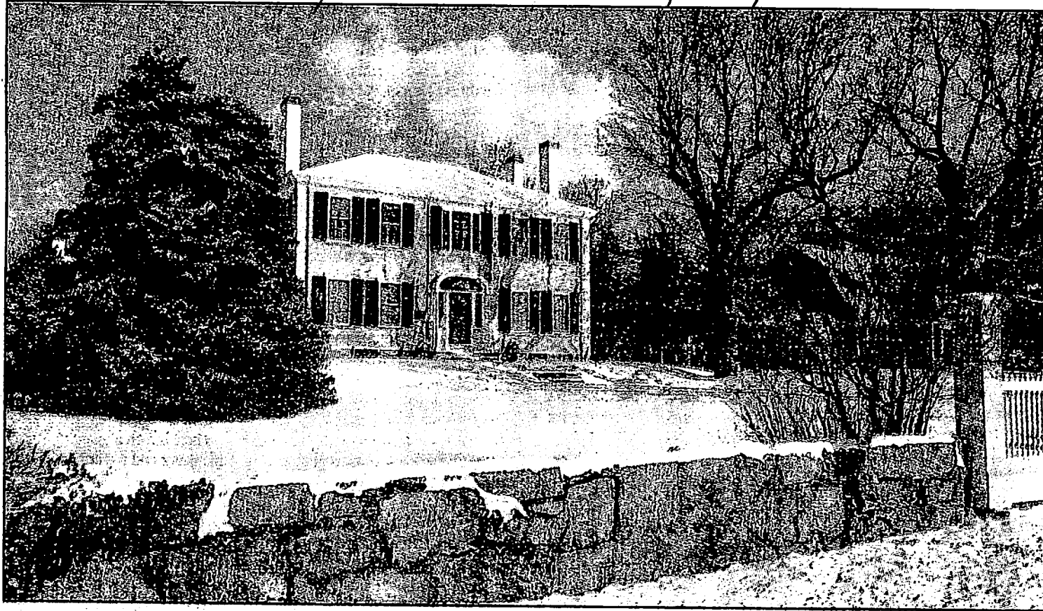
The King Caesar House is illuminated by a fresh blanket of snow.